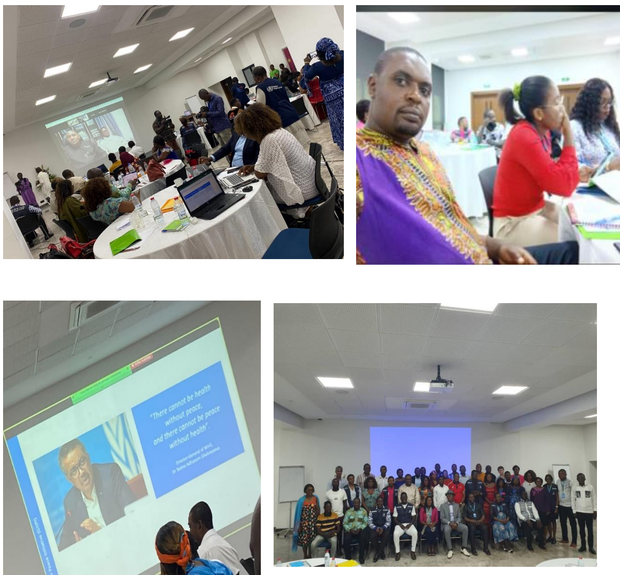
Fig 2.1: Workshop On the Elaboration of a Health Risk Map Using the Tool “Star”