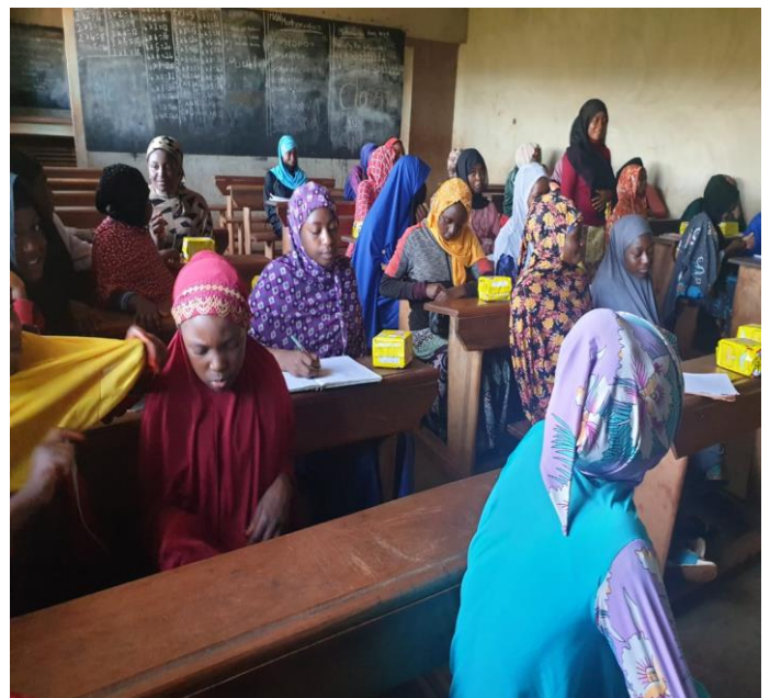
Fig 2.1: Workshop On the Elaboration of a Health Risk Map Using the Tool “Star”