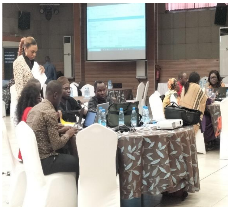
Fig 2.1: Workshop On the Elaboration of a Health Risk Map Using the Tool “Star”