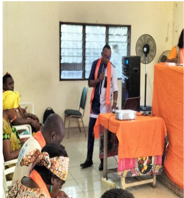
Fig 2.1: Workshop On the Elaboration of a Health Risk Map Using the Tool “Star”