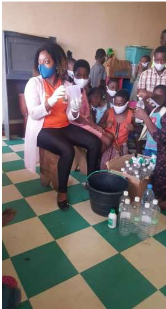
Training on the production of face mask and hand sanitizers