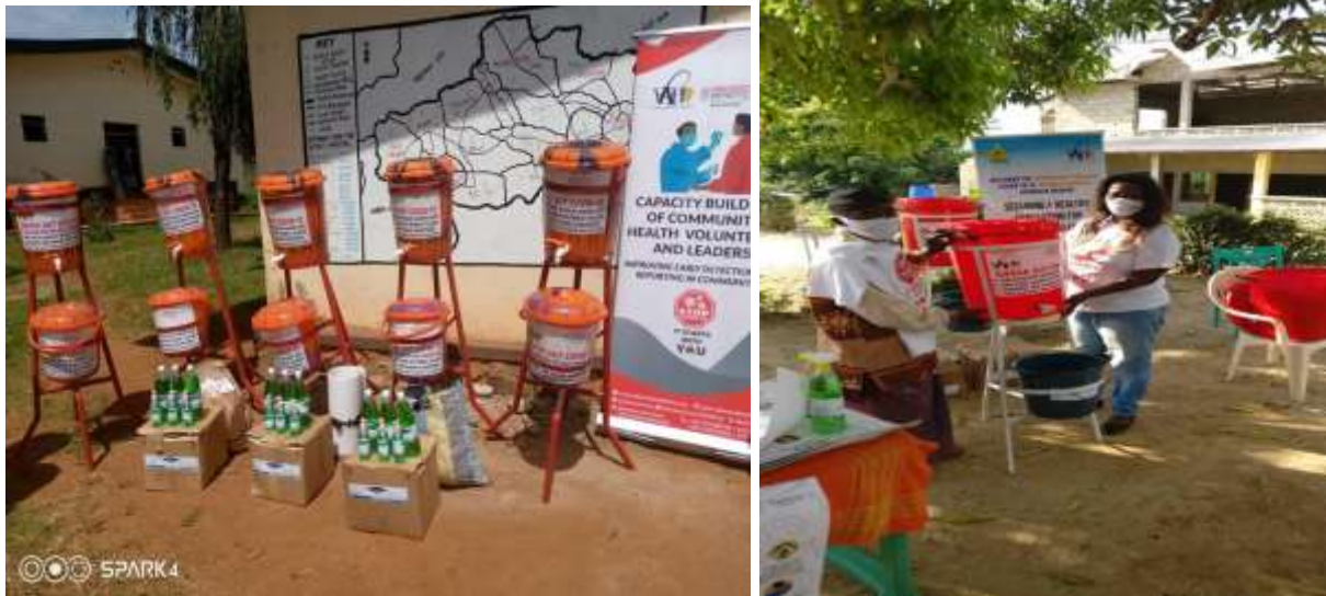
Donations made at the mbengwi health district and Ntonde village

In collaboration with Abii foundation and Prudential Beneficial Insurance, VAHA made several donations in vulnerable areas in five different regions in Cameroon including hand wash stations, sanitizers, face mask to battle COVID 19 pandemic.