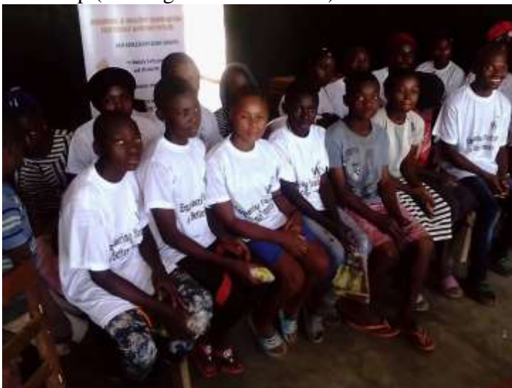
cross section of adolescents during routine clinic

VAHA currently runs an adolescent clinic in the Ndop (NW region of Cameroon). The aim of this project is to empower young boys and girls in crises zones to take control over their sexual and reproductive health and rights to reduce sexual violence and new infections of HIV and other STDs in the community. In 2019 VAHA was able to get over 150 adolescents counselled and screened for HIV/AIDS. Two of whom were tested positive for the virus and enrolled in the treatment center. This year VAHA has had over 300 adolescents benefited from its rural adolescent clinic.