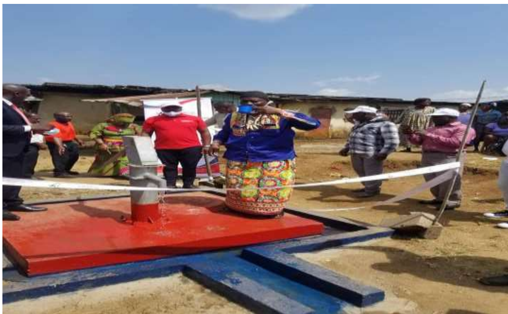
Borehole inauguration in nkongsamba

VAHA and her team in response to communities identified with no availability of portable water carried out the construction of enhanced wells in three communities in the Northwest, Littoral and West regions of Cameroon.