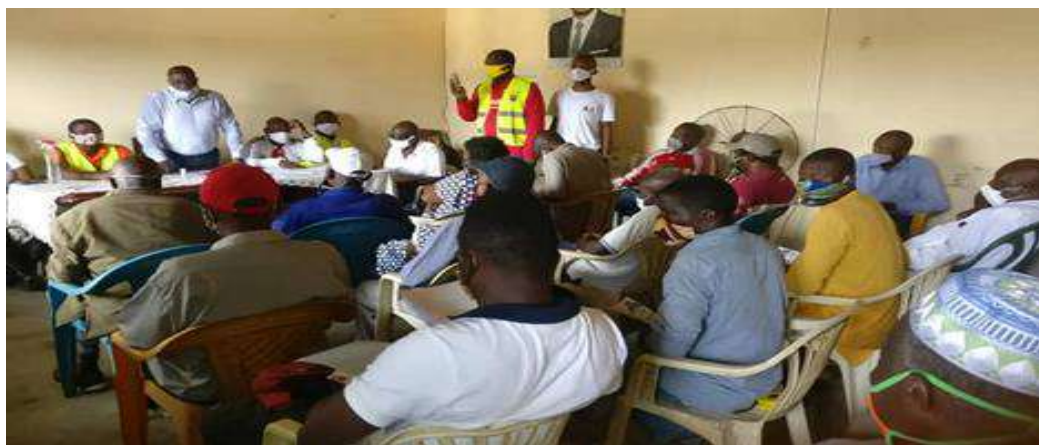
Community education and awareness raising

Following the outbreak of Cholera and COVID19 in Douala, the local government V in collaboration with the regional health delegation and the technical support of Value Heath Africa, organized a vast community awareness campaign on community case detection; available barrier measures in place. Sensitize the leaders on the reality of this pandemic, and educated the communities on the proper wearing and removing of mask, while also demonstrating effective and efficient hand hygiene methods. The leaders were also Informed about designated health facilities for the management of Cholera and COVID-19 cases. VAHA donated ten hand washing kits and 100 face masks to the Douala V municipality to fight against COVID19. The kits were handed to the mayor and regional delegation of public health by VAHA regional coordinator for Littoral. In addition, VAHA provided technical support to the municipality in developing a community response plan targeting 31 high risk communities for (community education, sensitization and awareness) which is currently being implemented. Washing Stations were distributed as follows; 3 markets, 3 public offices, 4 public establishments given to the Town Hall and 01 Station to the community of Beedi. Over 100 facial masks and 20 pieces of savon were donated to Douala 5th town hall for distribution to the communities.