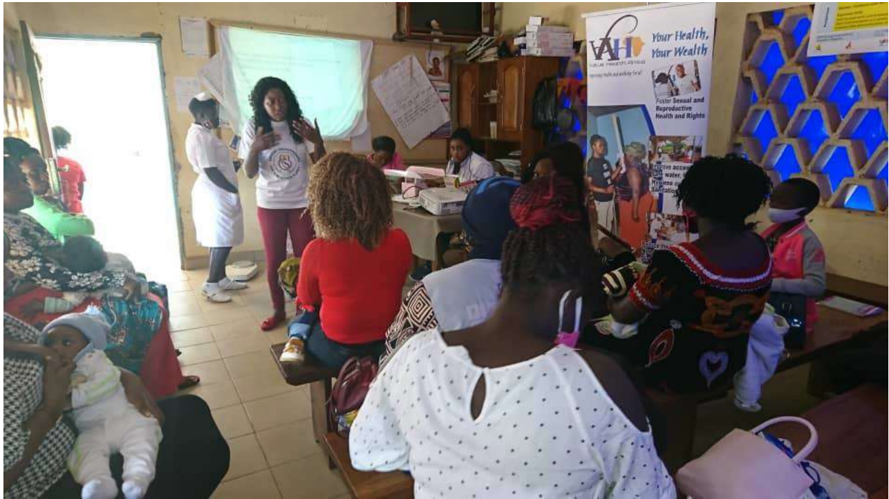
Health talk on breastfeeding

As part of our healthy lifestyle pillar with nutrition being a part and coupled with the current socio-political crisis plaguing the North West region of Cameroon, there was a need to continually encourage new moms so that, they can have the courage to brave all odds and still nurse their young ones rightly. Value Health Africa therefore conducted a breastfeeding sensitization activity at the Atuakom integrated health center where new moms and pregnant women were educated on breastfeeding, its benefits, the recommendations of breastfeeding, how to make breastfeeding a wonderful experience for both mother and baby, breast care tips and different breastfeeding positions. Over 20 new moms and pregnant women benefitted from this activity.