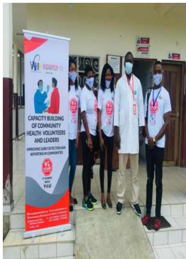
Capacity Building for CHV's in the Nkongsamba Health District