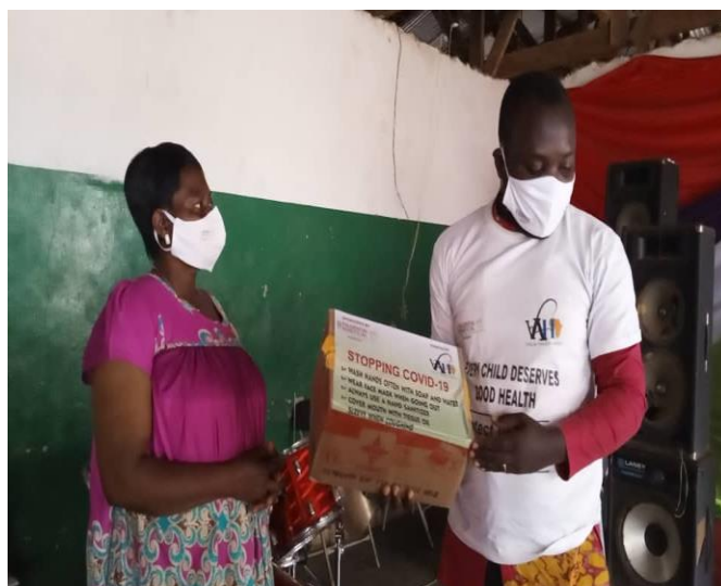
Donation at Misspa orphanage