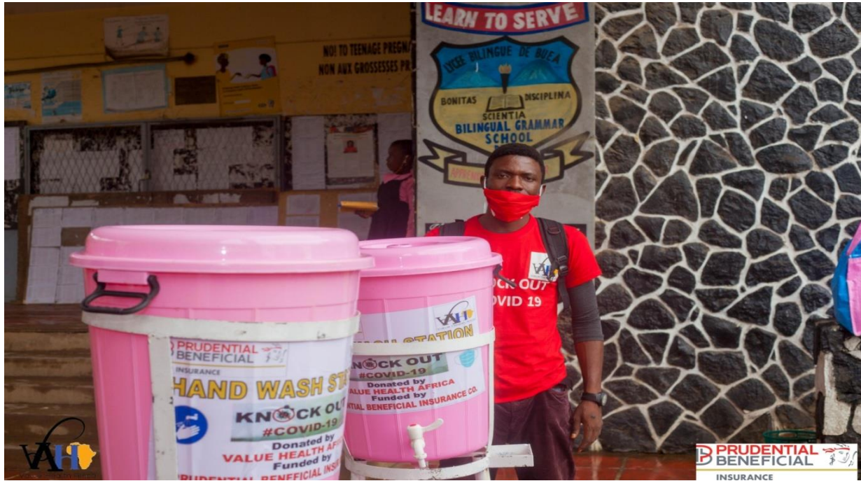
Arrival of VAHA Team at Bilingual Grammar School Molyko