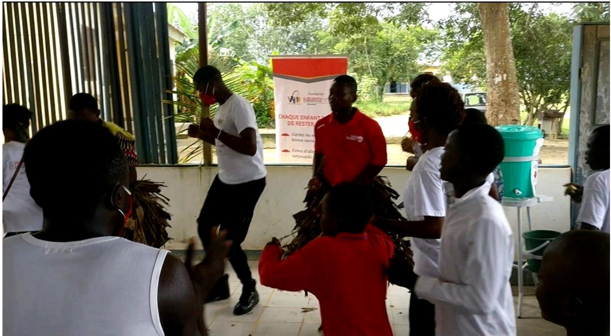
Beautiful moments at St Nicodem Orphanage as Orphans welcome VAHA Team