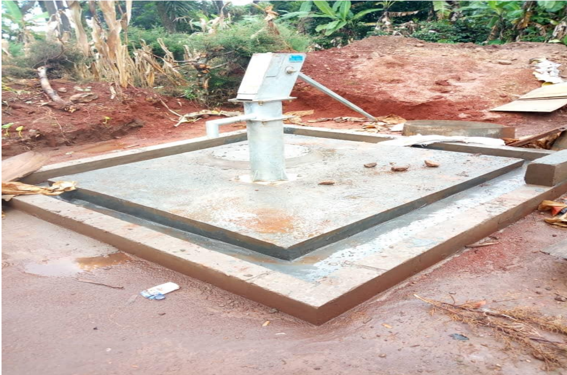
Enhanced well after Completion