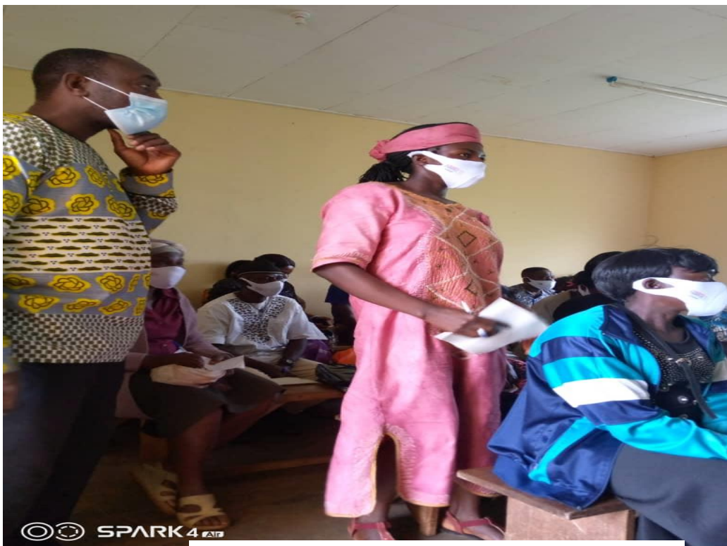
interactive moments with CHV's