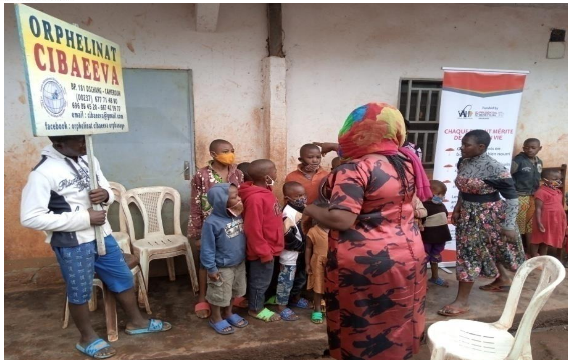
Health Education at CIBAEVA