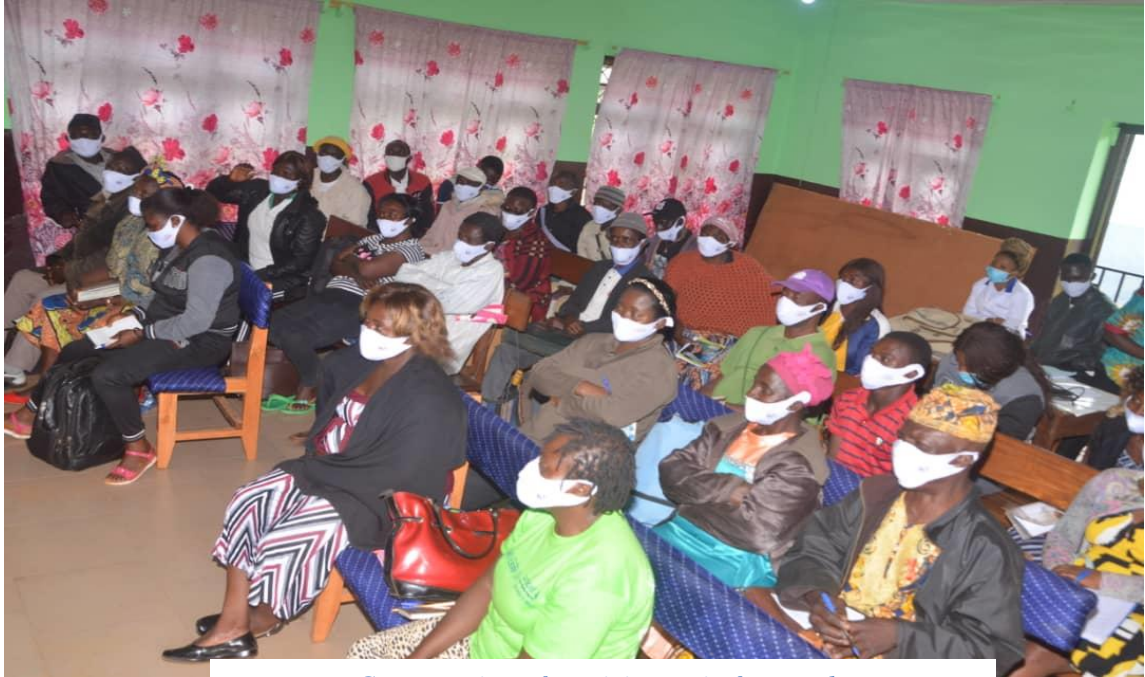
Cross section of participants in facemasks