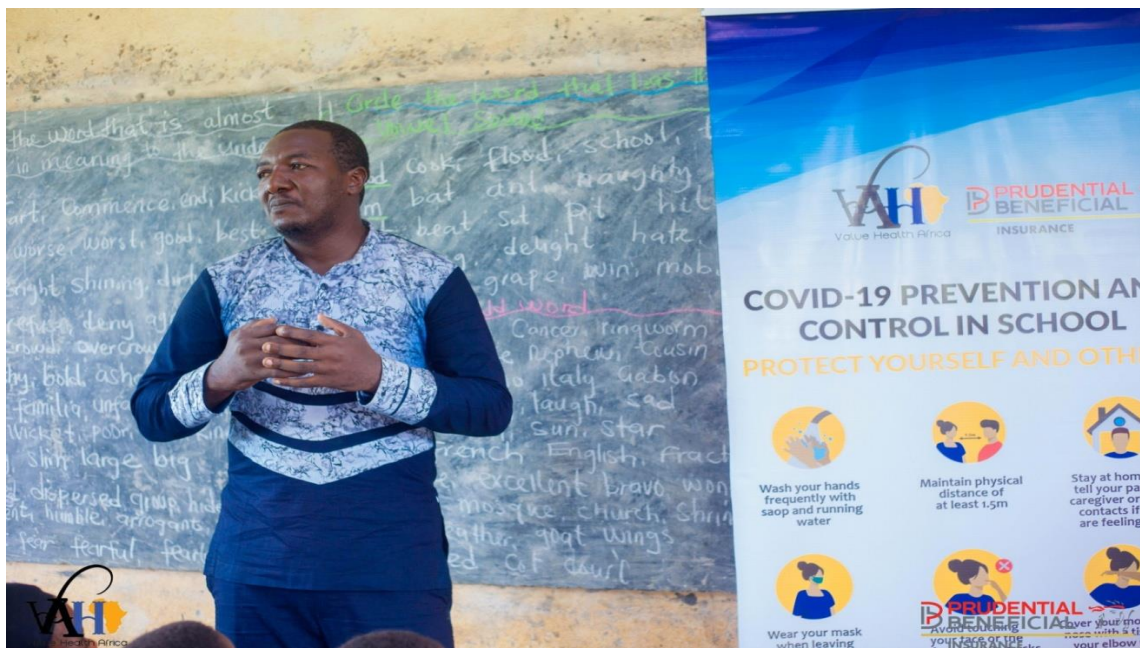
Sensitization on COVID 19 at GPS Bonadikombo