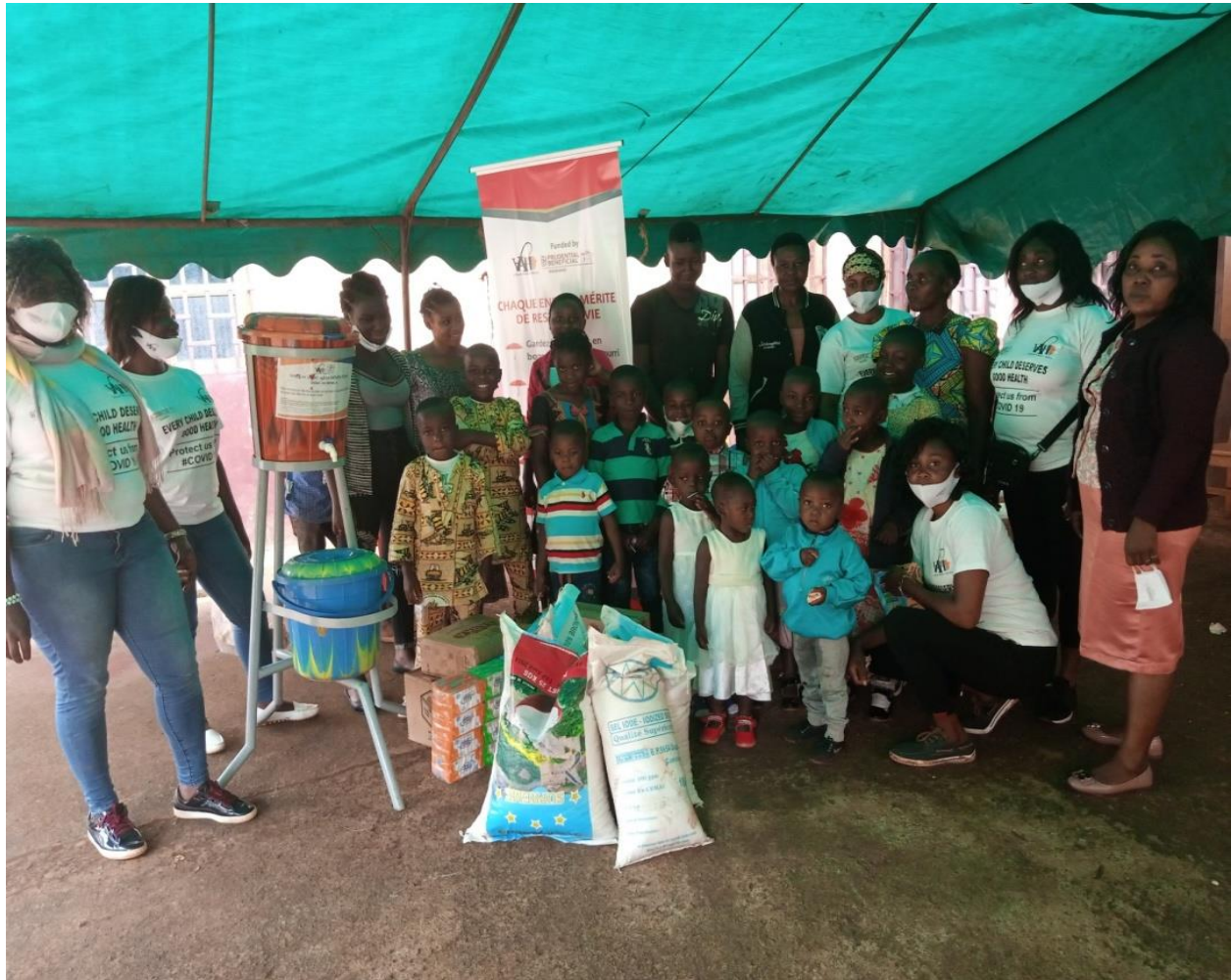
Donations to Orphelinat le Bon Samaritain, Mbouda