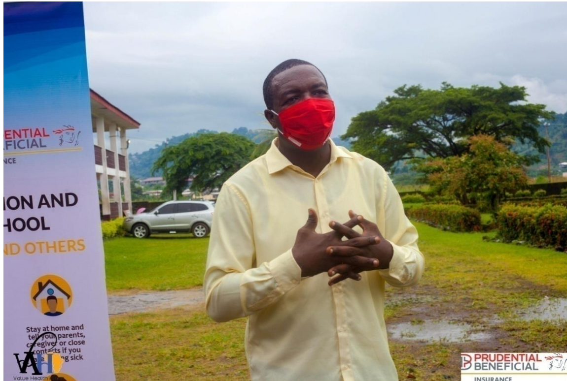
Head teacher of Bilingual Grammar School Molyko making his remarks

The Principal was very happy, thankful and grateful with the gesture by VAHA and Prudential Beneficial Insurance , she assigned some staff to place the Hand Wash stands at strategic positions around the school and promised to put them into maximum use