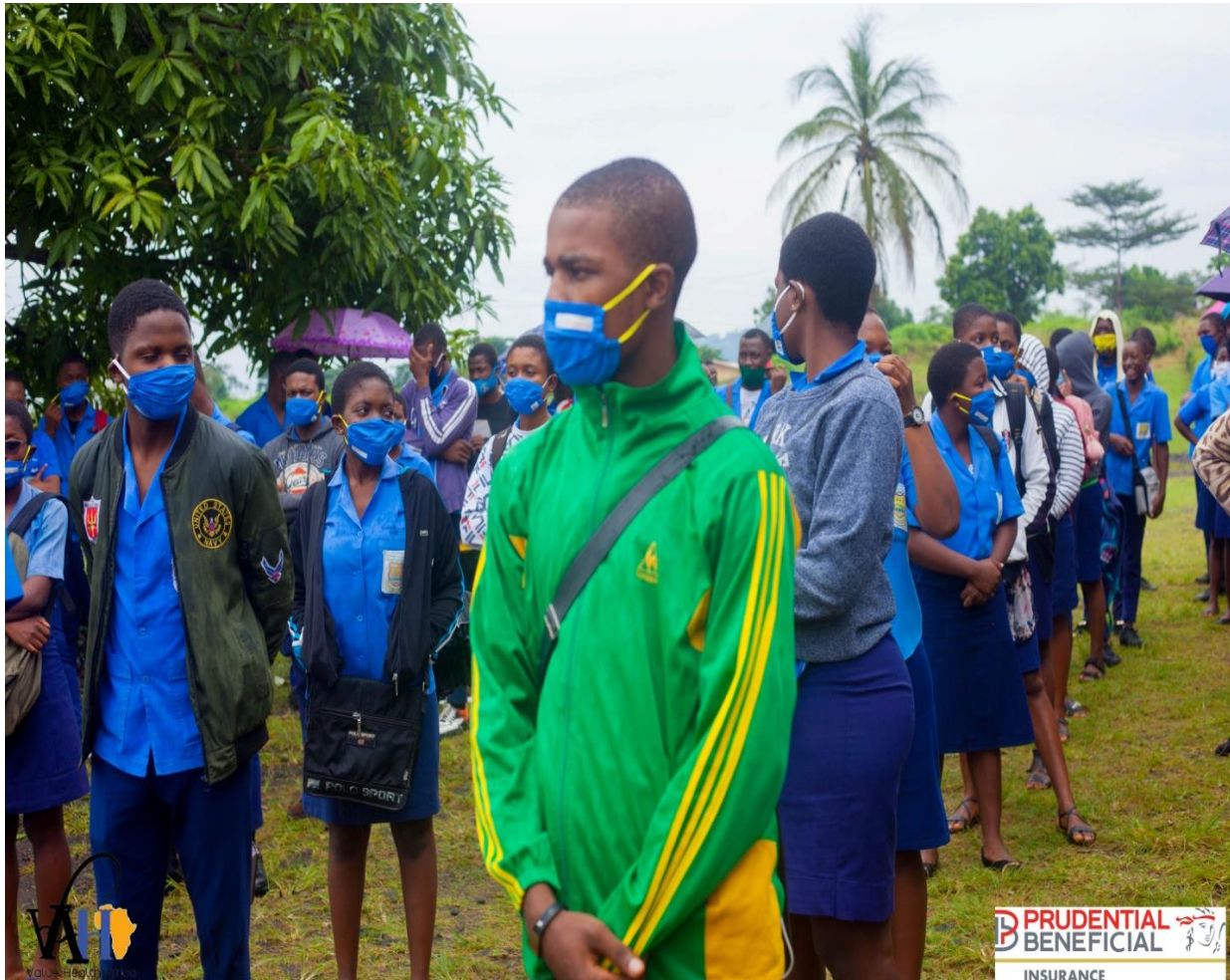
Students of BGS Molyko wearing face mask donated by VAHA