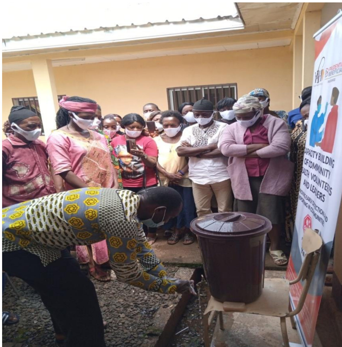
DMO of Tubah illustrating proper handwashing in front of CHVs