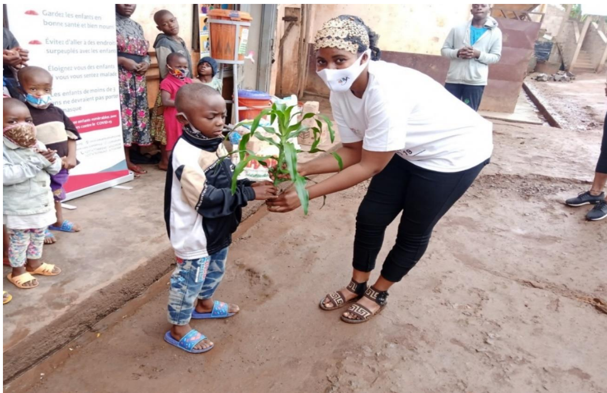
CIBAEVA Orphanage welcomes VAHA West Region Team