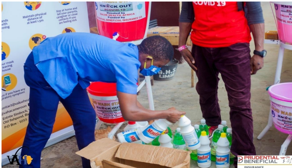
Display of donations for Bilingual Grammar School Molyko