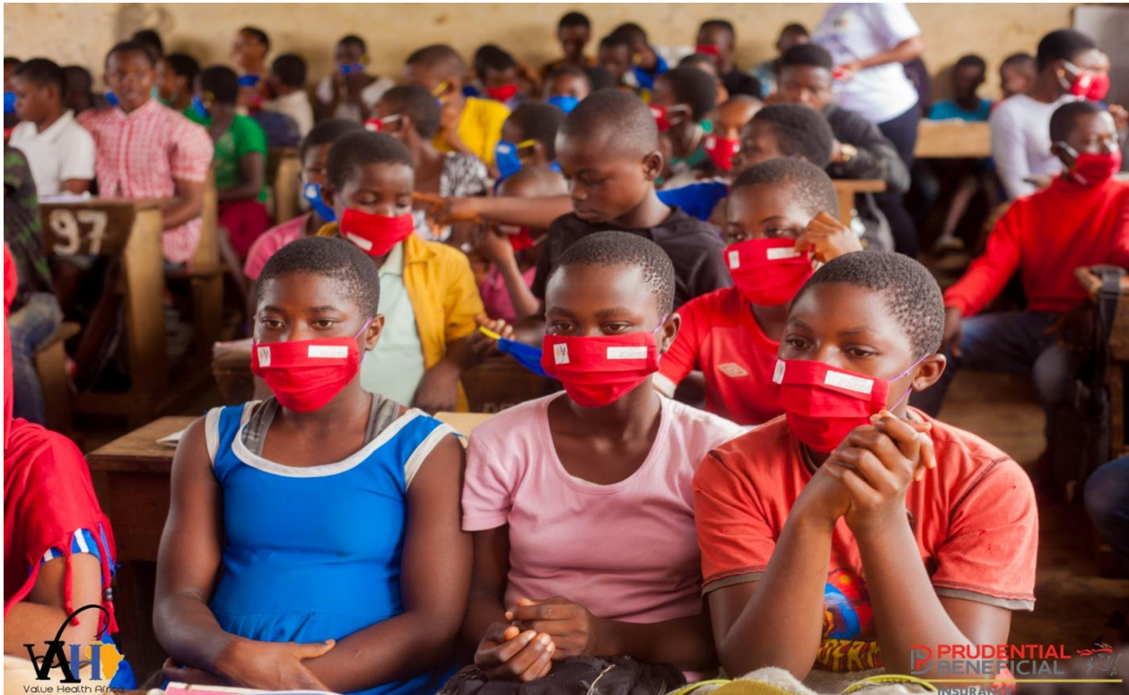
Pupils of GPS Bonadikombo wearing donated facemasks