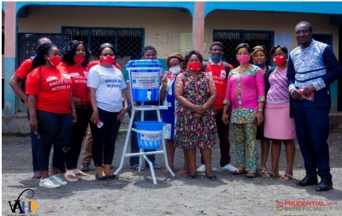
Donation of hand wash station at GPS Bonadikombo