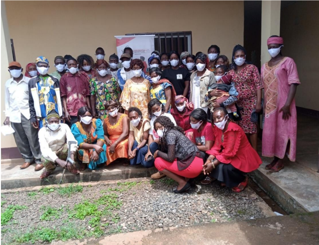
Community Health Volunteers and community leaders, Tubah