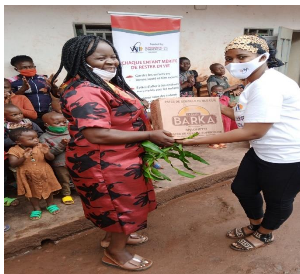
Donation at CIBAEVA