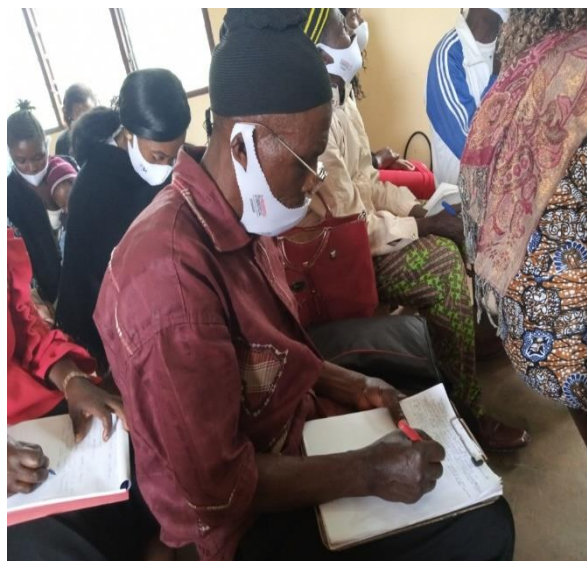
Capacity building in Ntonde