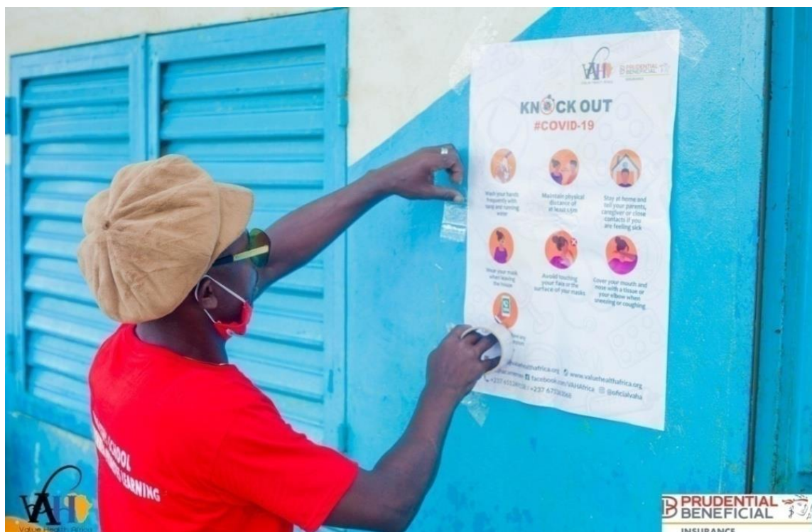
Donation of sensitization posters to Wise Bilingual Institute Mfou