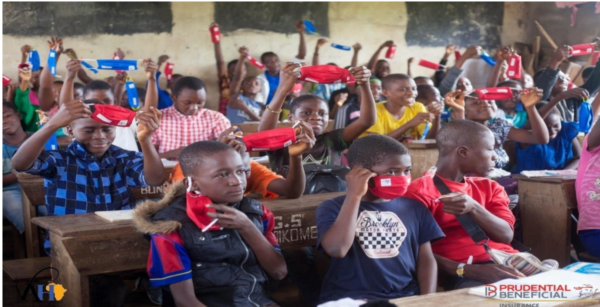
Mask donation to pupils of Government practicing school Bonadikombo