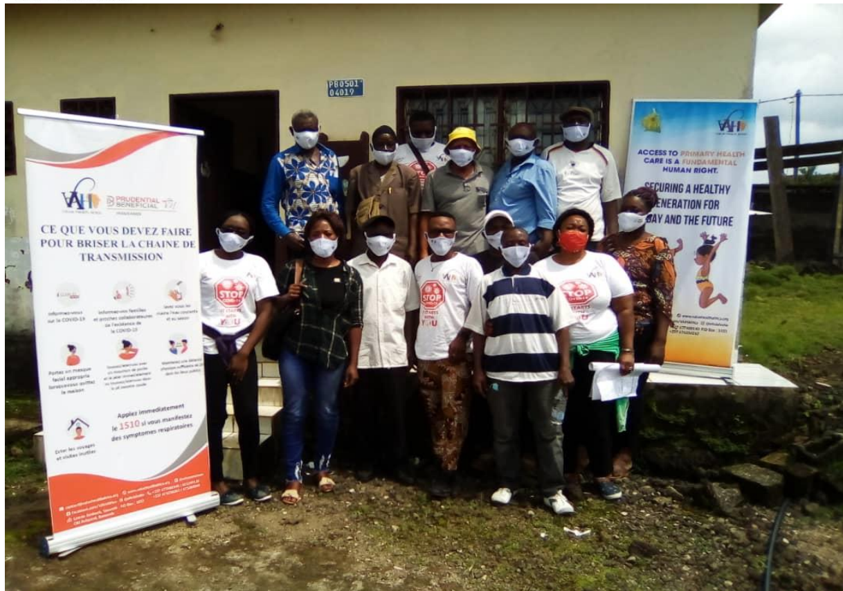
Capacity building in Loum