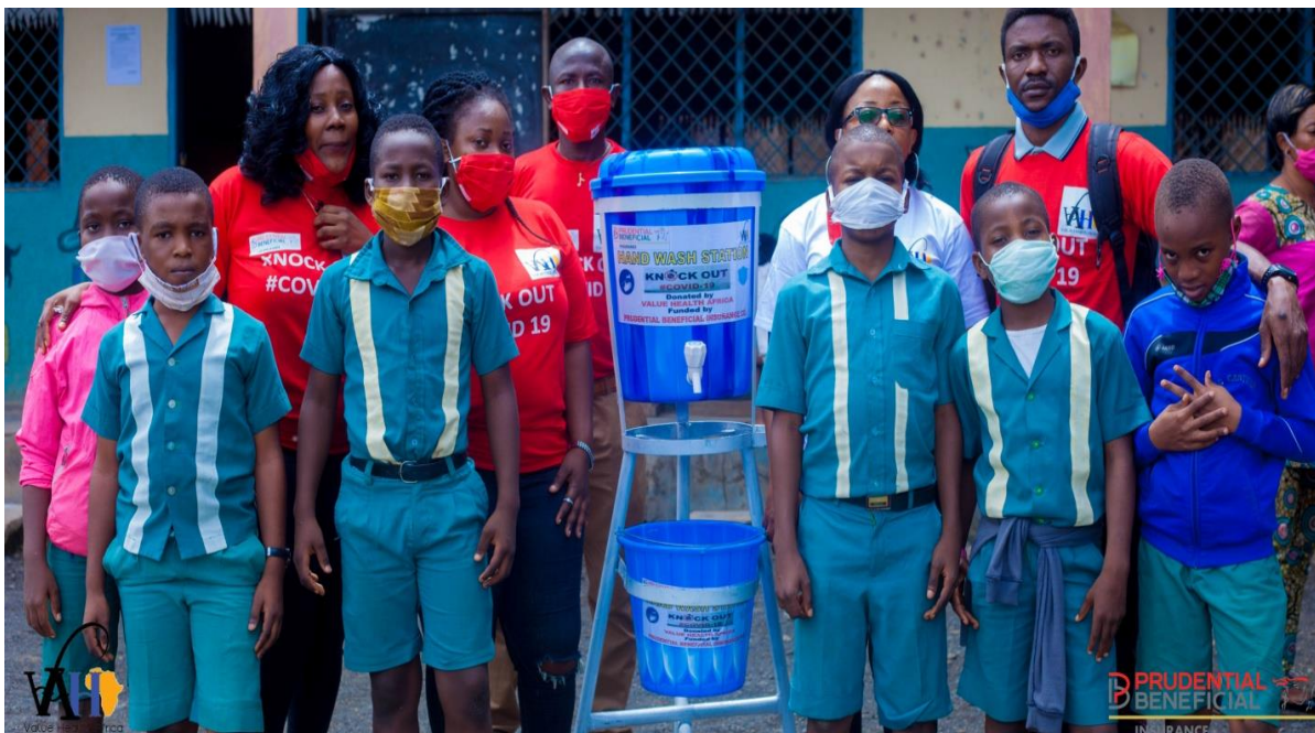
Pupils of Sabiba Nursery and Primary School