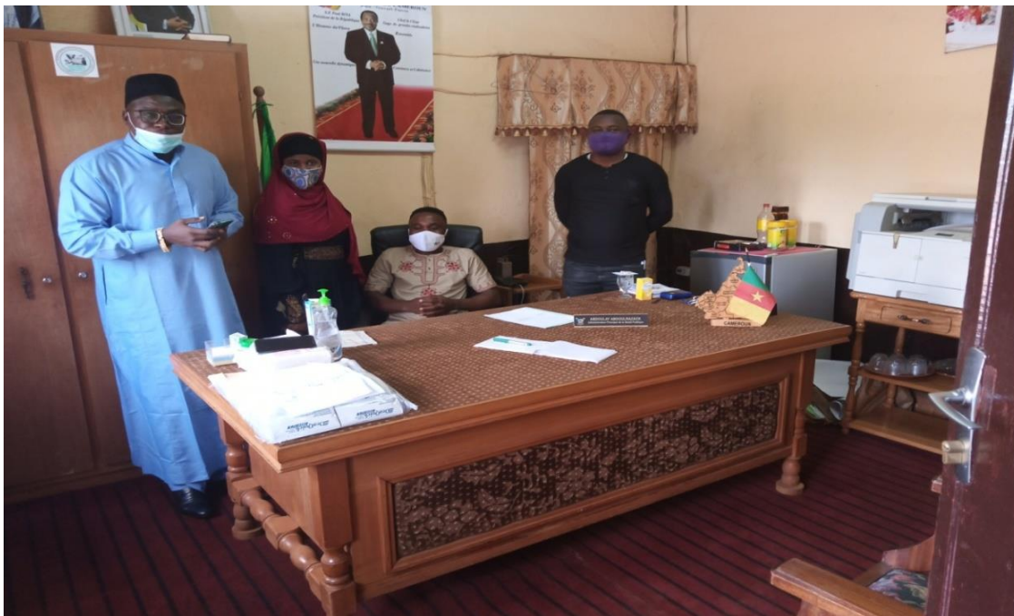
Meeting with stakeholders of West Region