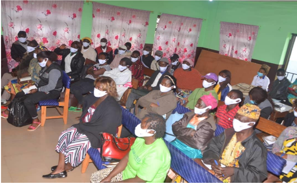
Cross section of community health workers and community leaders of Santa