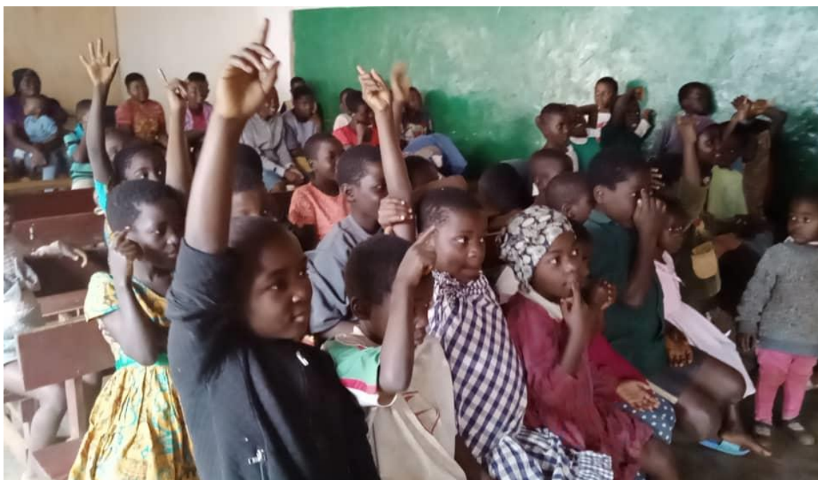
Sensitization at Misspa orphanage