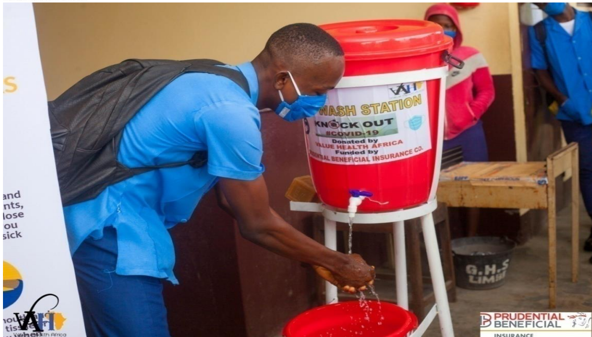
Demonstration of handwashing by a student of BGS Molyko