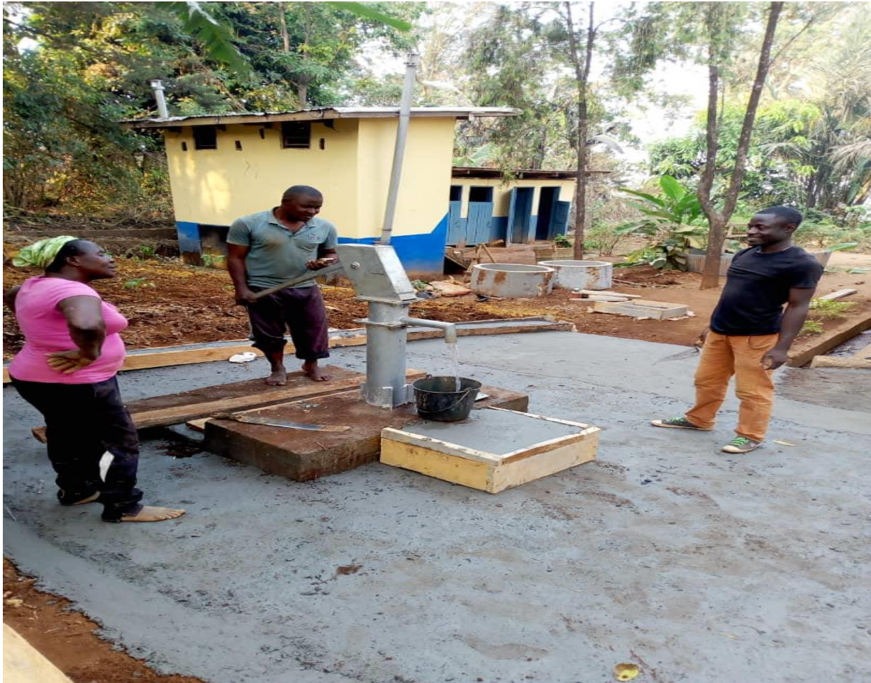
Enhanced well-constructed for the Ntialong Balatchi community

Hand hygiene has been identified as a primary preventive measure to decrease the spread of COVID -19. However, the availability of portable water to carry out hand washing is a major concern in certain disadvantaged communities in Cameroon. One of the targets of this project is to provide assistance to certain populations most at risk to COVID-19. To this effect, three vulnerable communities in 3 different regions were chosen to benefit from enhanced. In this first phase, one enhanced well have been constructed in Balatchi, in the west region of Cameroon. Balatchi is a rural community with over 10,000 inhabitants and have been facing water crises. In this community water born diseases like Typhoid is one of the most prominent cause for hospital visits.