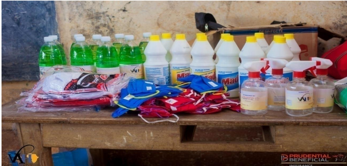
Donations of hygiene kits to Bilingual Grammar School Molyko