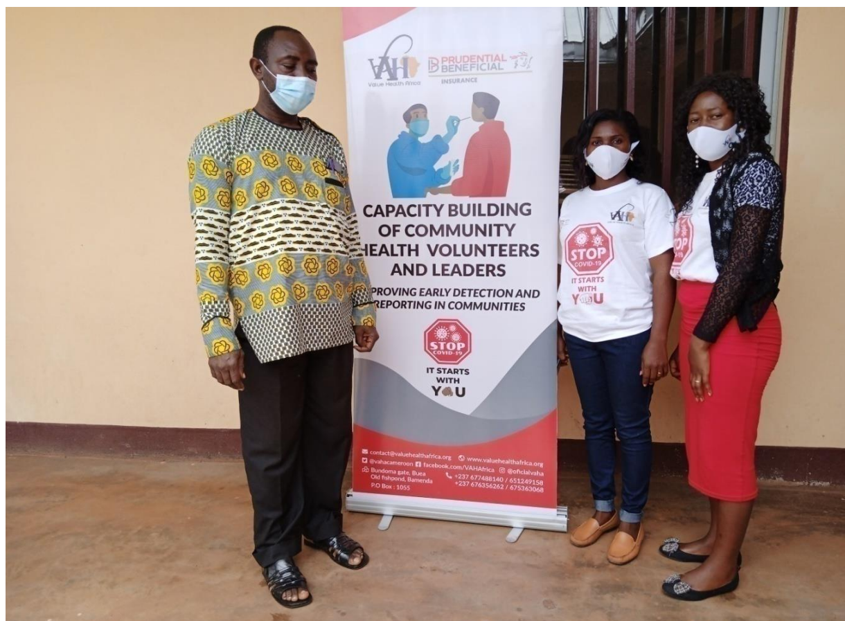
DMO of Tubah health district and VAHA team

Community health volunteers and opinion leaders are key actors in community disease surveillance as they play a vital role in enhancing early detection and reporting of cases in the communities. One of VAHA 's key strategy in COVID-19 response is building capacity for these players. In this first half of the project, VAHA has organized several workshops in 3 regions of Cameroon. So far 10 capacity building workshops have been organized where over 500 community health workers and 500 community leaders have been trained.