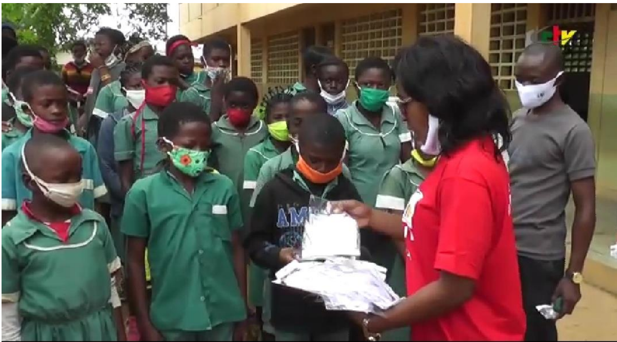
Sharing of face mask at Annexe G1 de Mfou primary