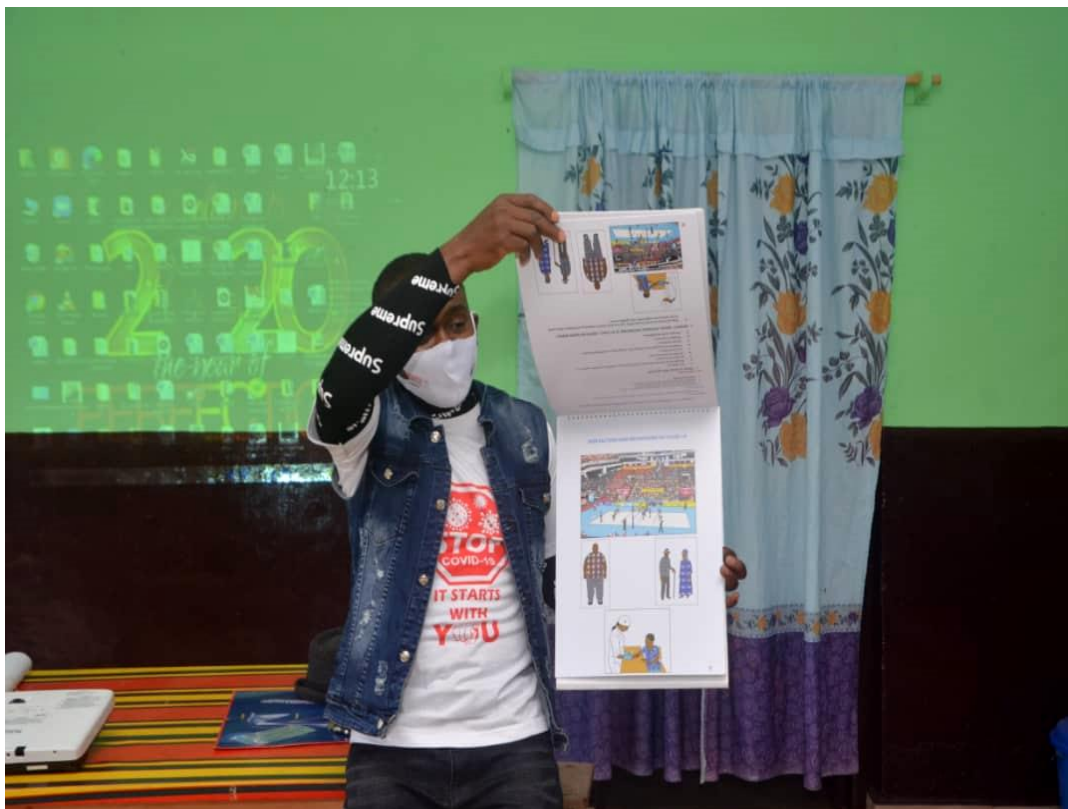
Figure 25: DMO of Santa health District carryout the training workshop in his district