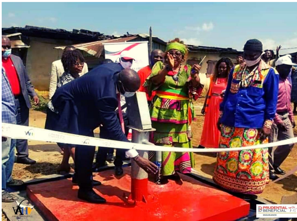
Inauguration of Enhence well Nkongsamba- Littoral