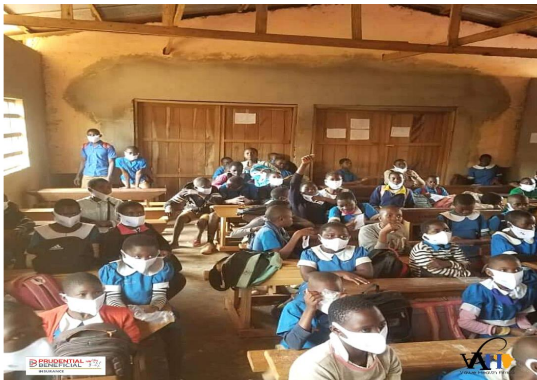
Figure 6: Government Bilingual primary school Dschang.