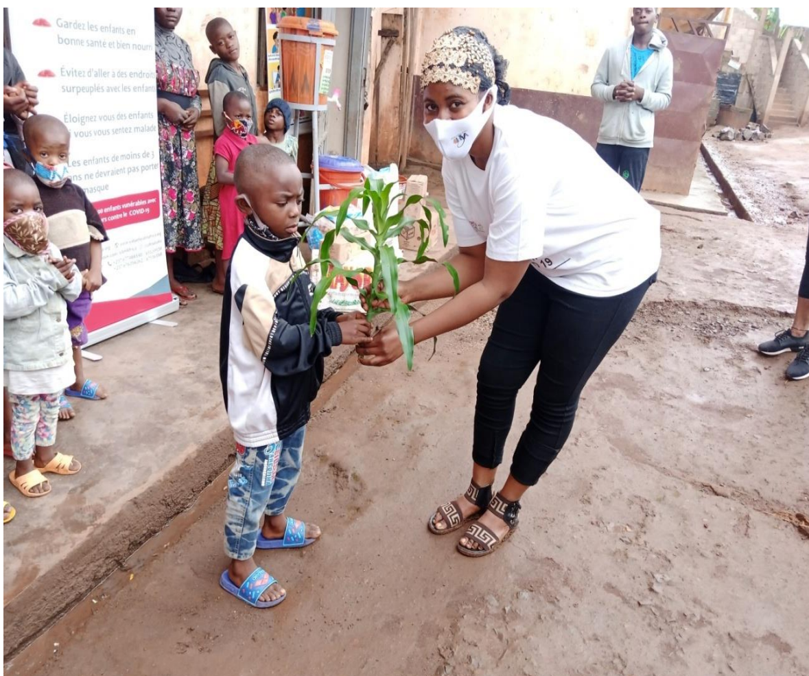
Figure 13: CIBAEVA Orphanage welcomes VAHA West Region Team

Most often, during pandemic periods like this, orphanages are more vulnerable and most affected and as such a priority for humanitarian assistance. Value Health Africa sticking to her mission, and accompanied by some prudential beneficial insurance staff, paid a visit to 12 orphanages selected in 5 regions of Cameroon (Central, West, South West, North west and Littoral), benefitting from hand washing stations, face masks, hand sanitizers, posters, t- shirts and food items.