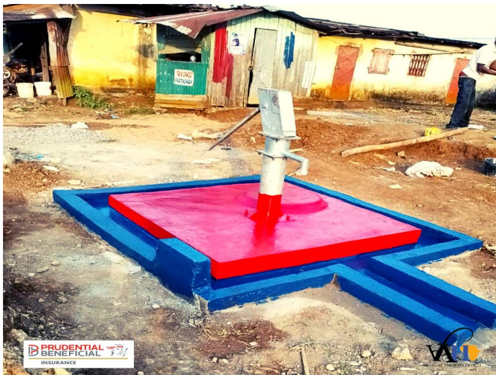
Figure 34: Enhanced well after Completion Nkongsamba - Littoral