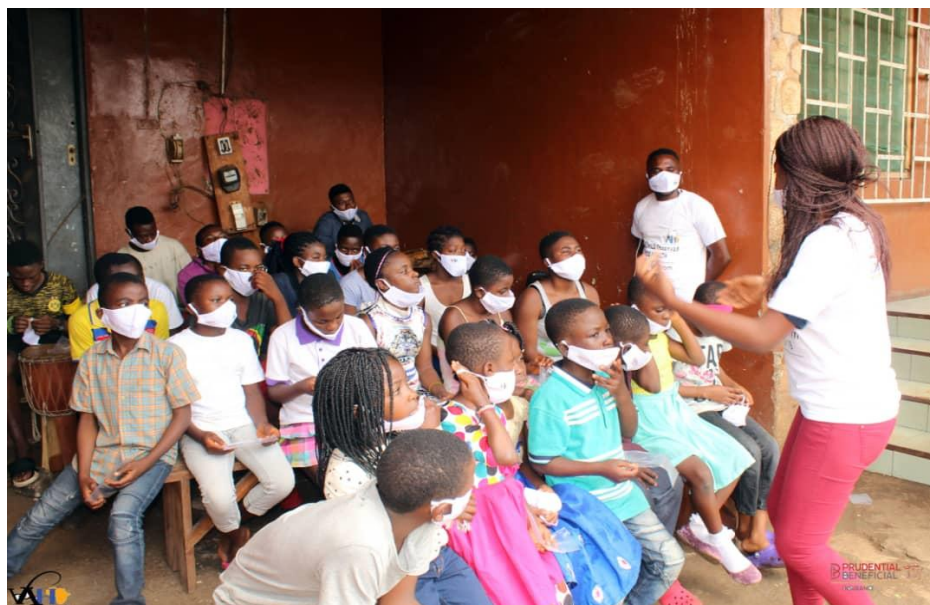
Figure 16: Orphan's education