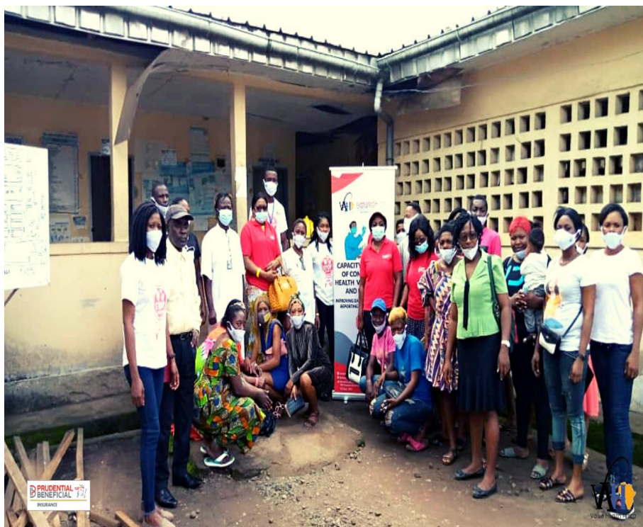
Capacity building at Idenaou health District