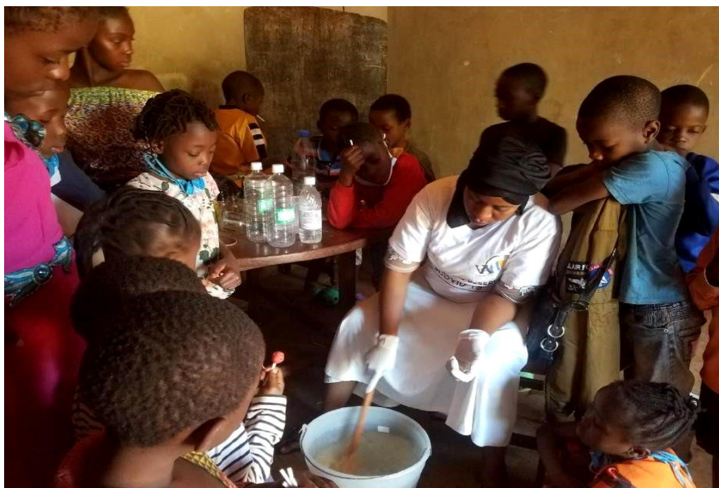
Figure 22: Training workshop on hand sanitizer production DORCAS