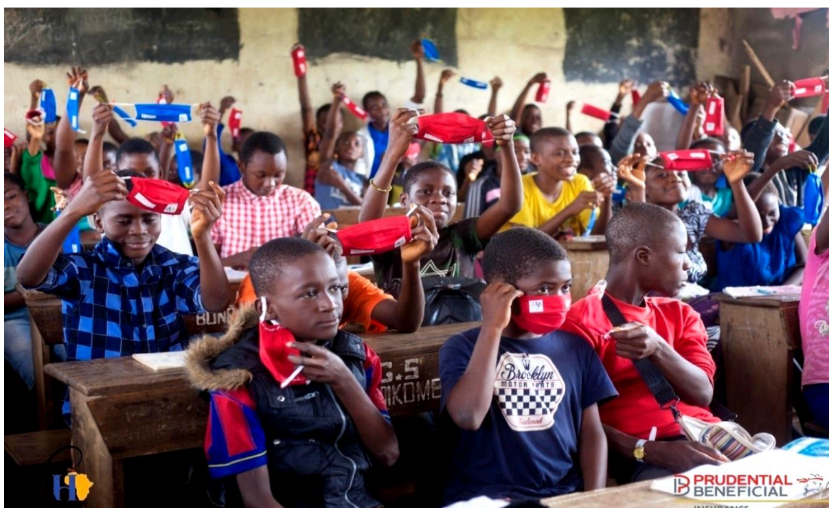
Figure 1: Showcase of mask given to pupils of Government practicing school Bonadikombo

With an expectation of reaching out to over 20,000 school going children, 20 schools were selected in 5 regions of Cameroon which were Littoral, Central, South West, West and North o benefit from sensitization on COVID-19, hand washing stations, face mask, hand sanitizers, detergents, posters and branded t- shirts. This is because; schools are highly vulnerable during outbreaks. At the end of the project 20 schools have benefitted from this activity and 21 908 school children were reached.