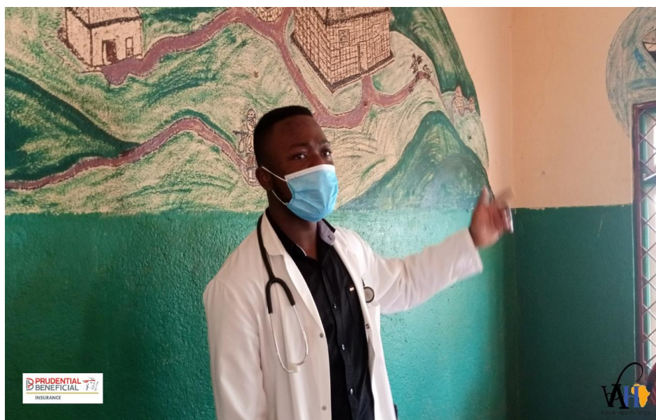
DMO BALI Health District