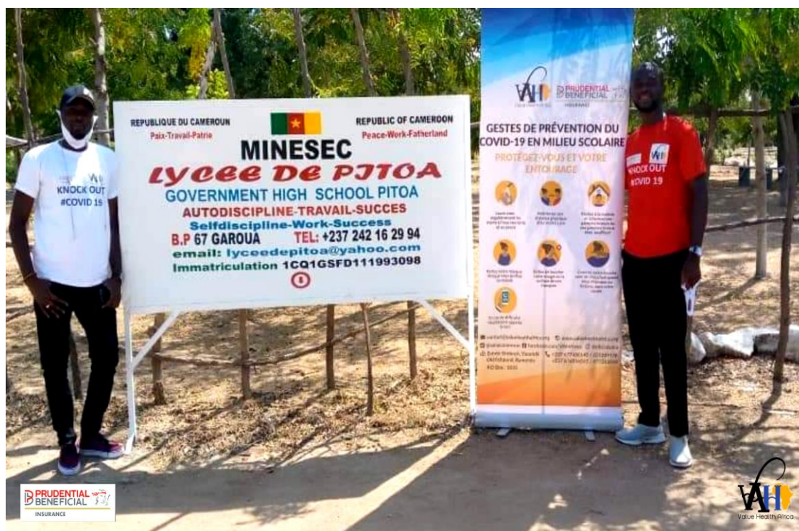
Figure 8: VAHA at Lycee de PITO A – GAROUA

The Head Teacher was very happy and impressed with our gesture, she Thanked us so much, in her interview on media present, she expressed great joy, satisfaction and special gratitude to Value Health Africa and Prudential Beneficial for the wonderful gesture, and wished that we should be visiting the school every time and make the school our partner school in the South West, she also wished we could bring more T-Shirts, since the ones we gave would not be enough for all the staff. The pupils were visibly very grateful and happy as they were brandishing their new face masks and gathering in front of the posters we put around the premises