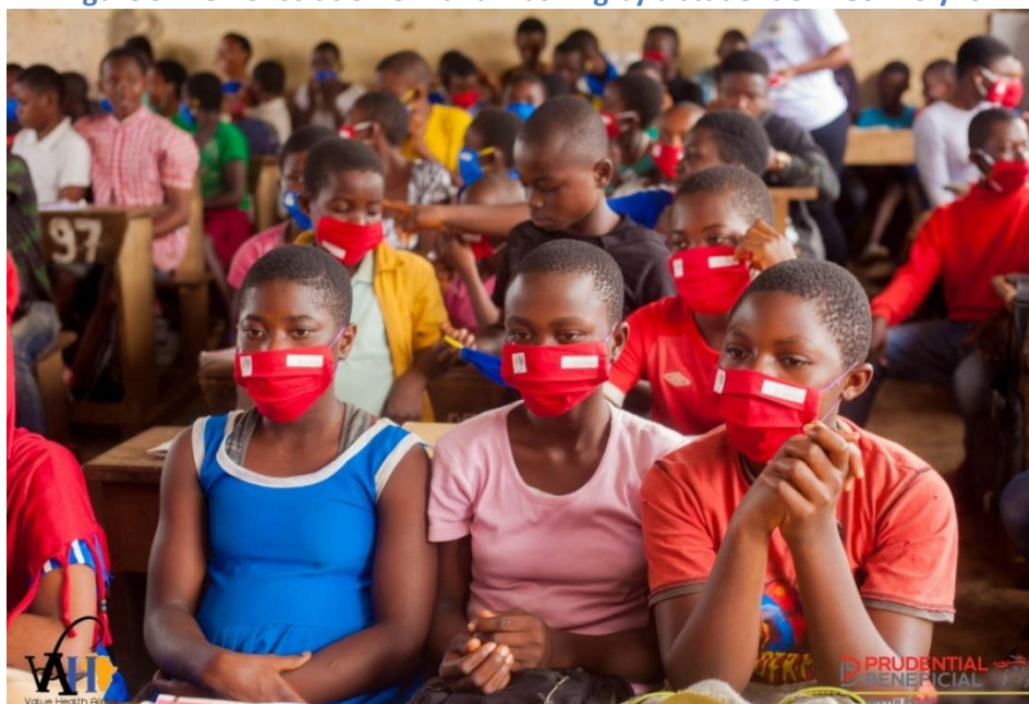
Figure 10: Overview of pupils of GPS Bonadikombo putting on their new facemasks