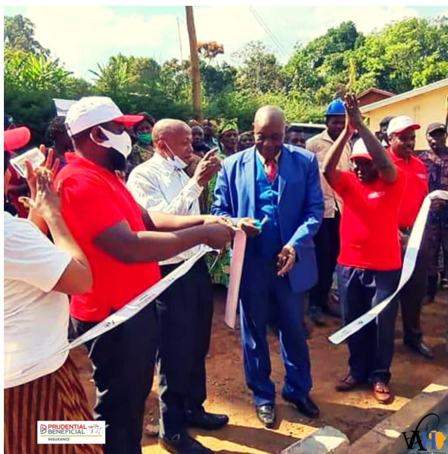
figure 30: Enhanced well-inauguration theNtialongBalatchi community

In as much as hand hygiene is a paramount preventive measure to decrease the spread of COVID-19, the availability of portable water to carry out hand washing is a major concern. With one of the aims of this project being to provide assistance to the population who are most at risk and the most vulnerable to COVID-19, three vulnerable communities in three different regions were selected to benefit from enhanced wells. This gesture will help the communities not only to prevent the spread of COVID-19, but generally to practice hand, domestic and food hygiene thus prevent the spread of not only COVID-19 but also other communicable diseases.