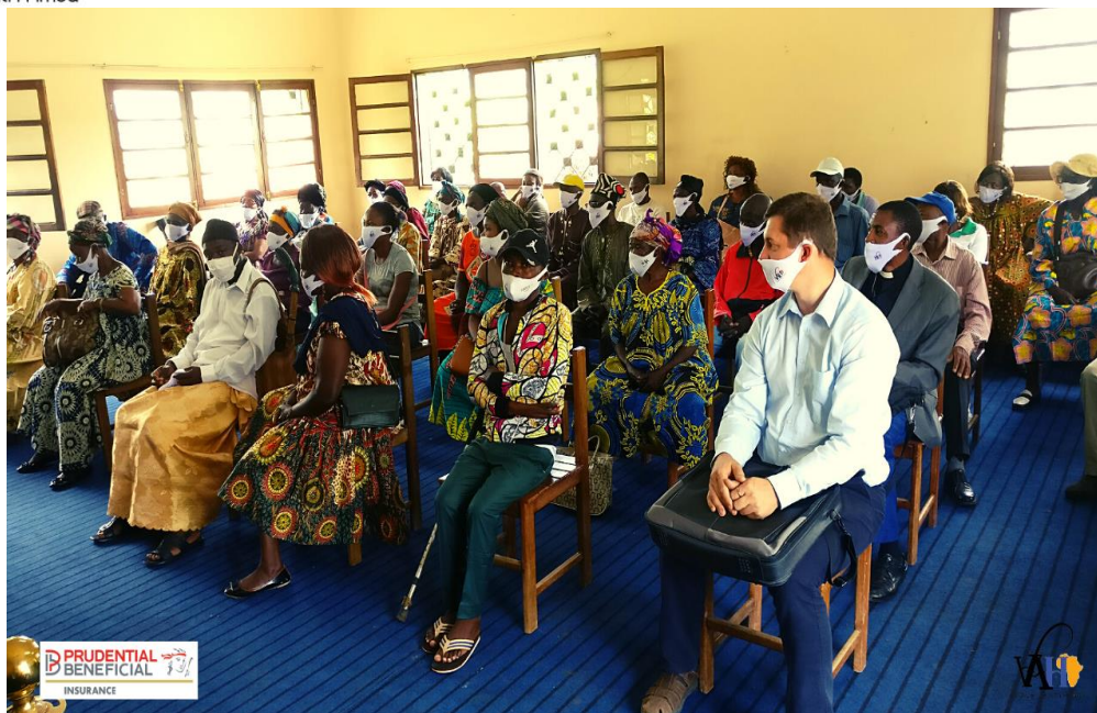
Figure 24: Capacity Building for Community Leaders in Mouam-Mboh / Nkel-MbengNkongsamba