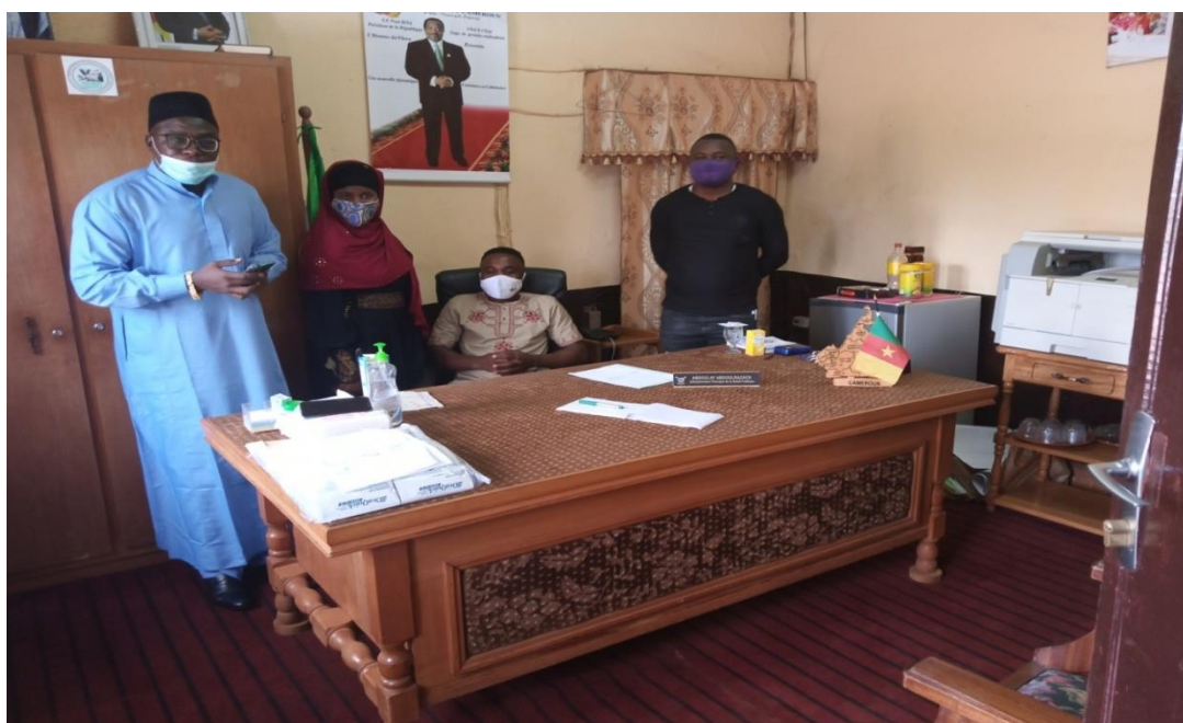
Figure 31: Meeting with stakeholders of West Region