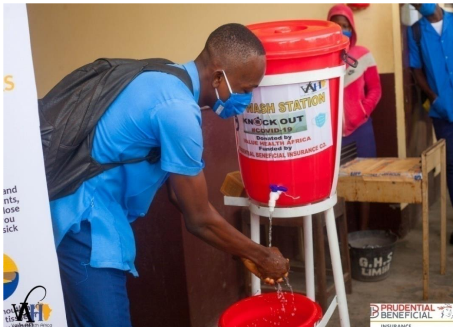
Figure 9: Demonstration of hand washing by a student of BGS Molyko