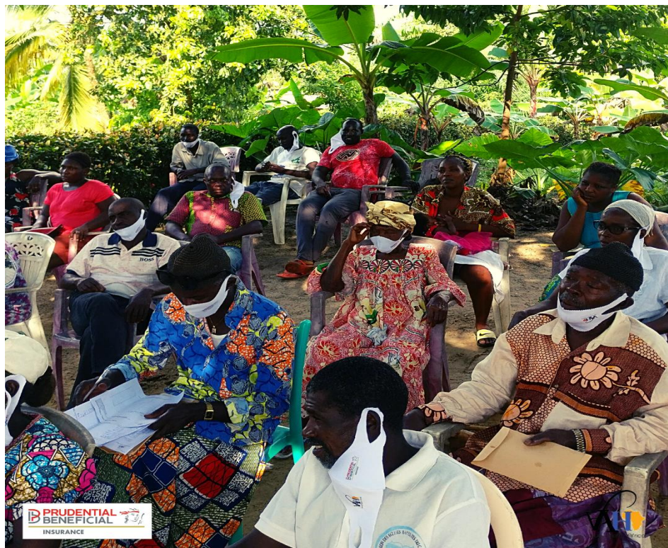
Figure 29: Capacity building Ntonde community leaders