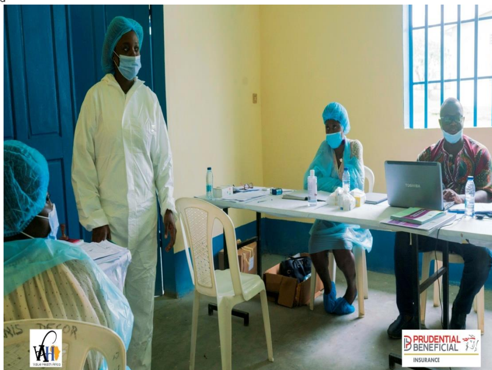
COVID-19 Laboratory – Bangue Health District

“At a time like this , we need more advocates to go into the communities and bring more people for testing and so this will help us have skilled people in communities who know what is required and therefore there will be rapid reporting in communities”