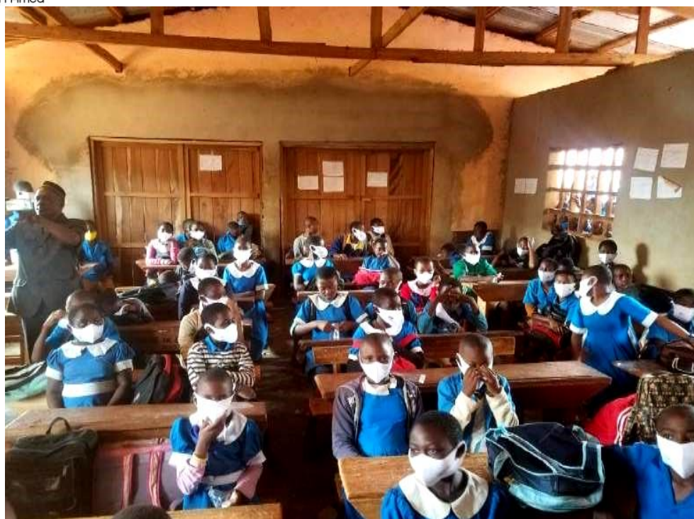
Figure 11: Government Bilingual primary school Dschang.