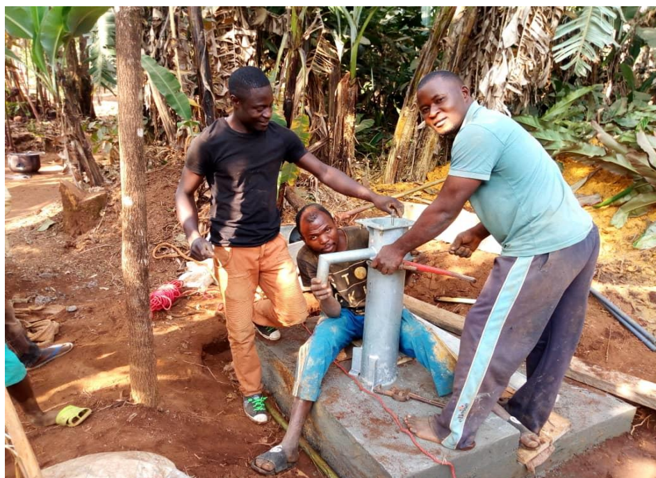
Figure 33: Construction of well