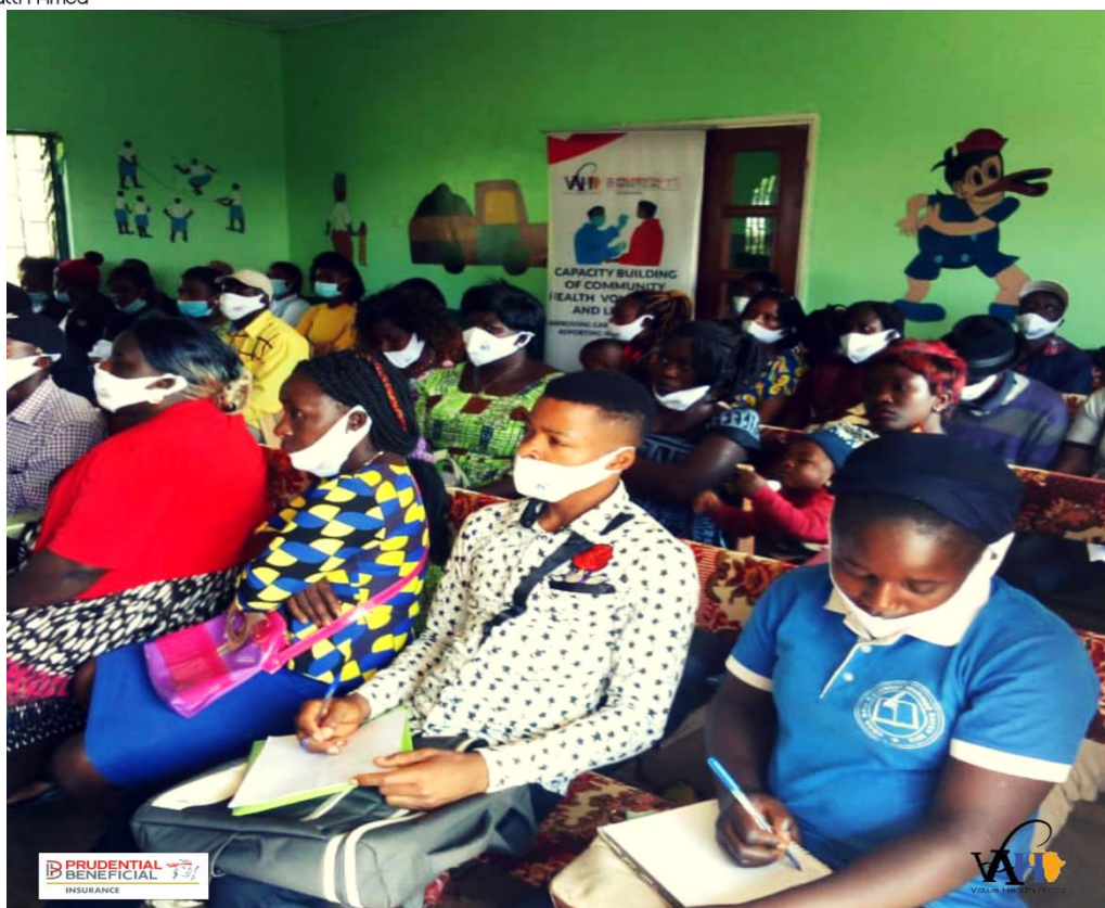
Figure 1: Cross section of community health workers and community leaders of Bafut