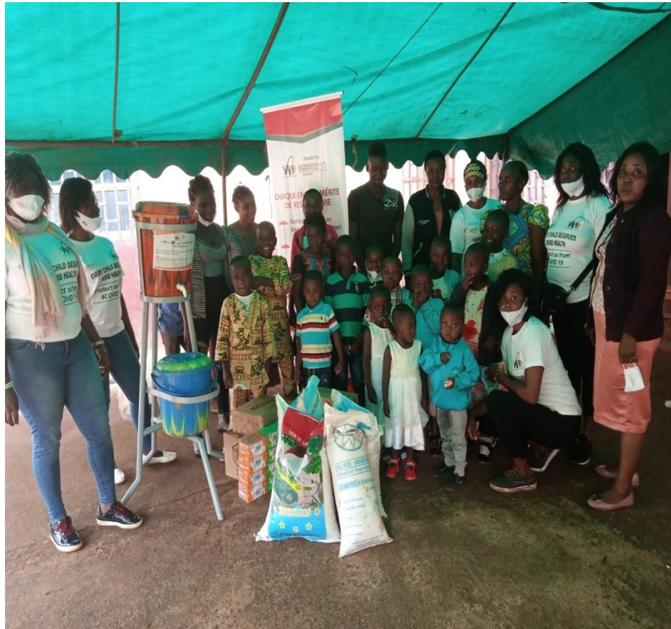
Figure 14: Display of donated items at Orphelinat le Bon Samaritain, Mbouda