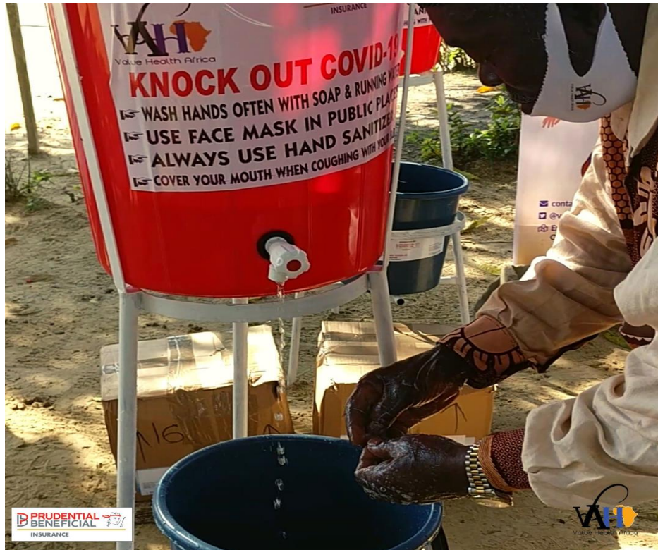
Figure 26: Chief of Ntonde Village showing hand washing during workshop