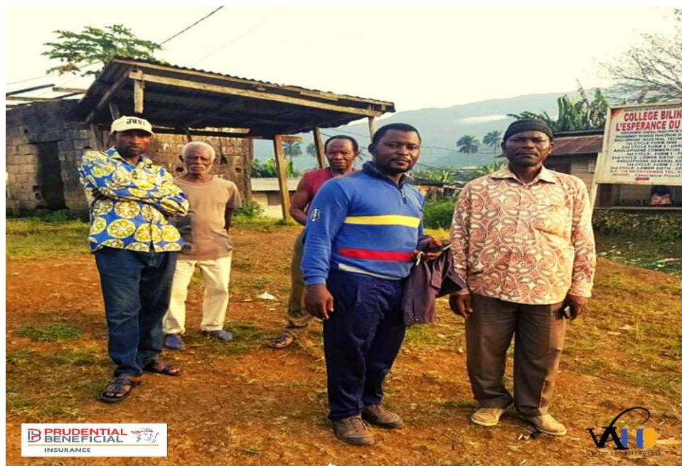
Figure 32: Meeting with stakeholders of Littoral Region