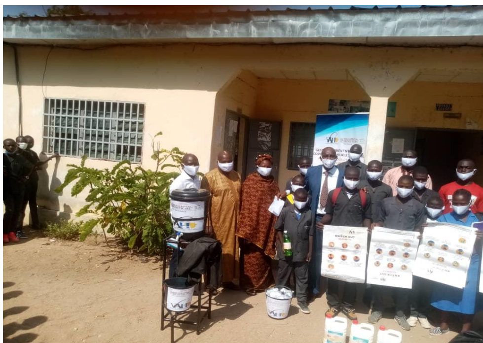
Figure 12 Lycee de PITOA in the North