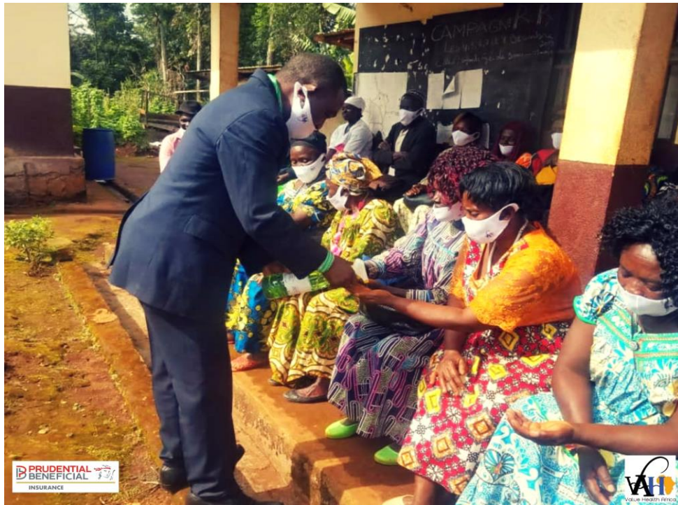
Figure 28: Capacity building With Balatchi community