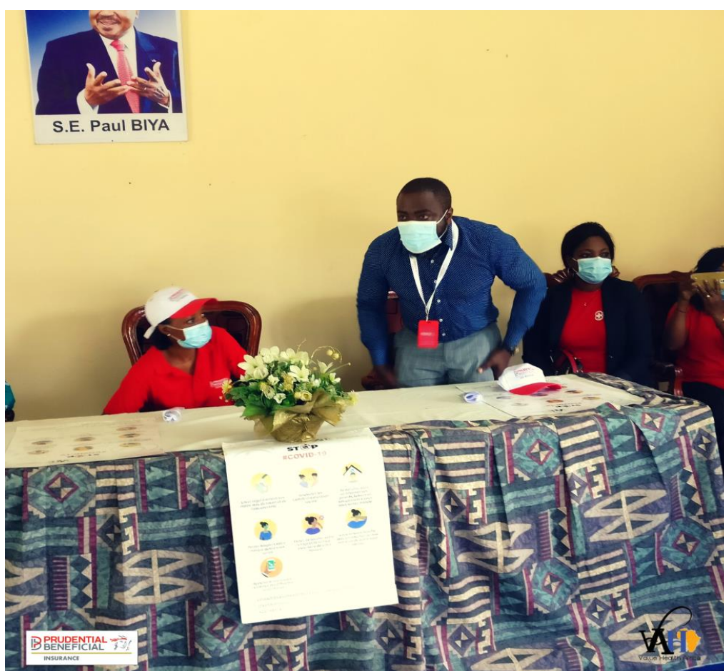
Figure 23: Prudential Beneficial insurance during the community leaders Capacity Building Nkongsamba

In order to improve the sensitivity of the surveillance system through the early detection and reporting of cases in the communities, several capacity building workshops were held with community leaders and community health volunteers. In total, 1050 community leaders and 1050 community health volunteers from five regions (north west, south west, littoral, west, and central) were trained on community event based surveillance to improve the early detection of not only COVID-19 but also other epidemic prone diseases.