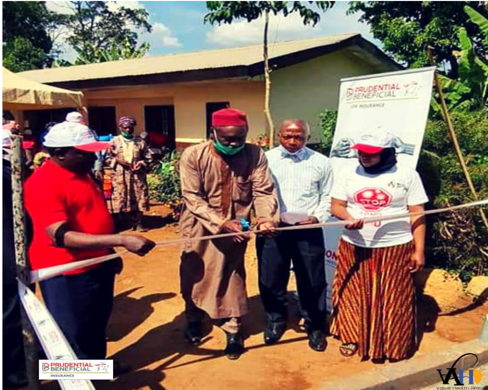
Inauguration Enhence Well Balatchi - West