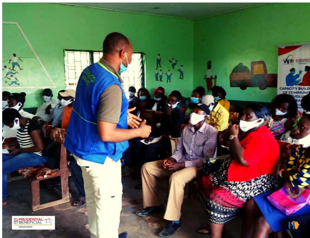
Figure 27: Community Health Workers, Bafut health district