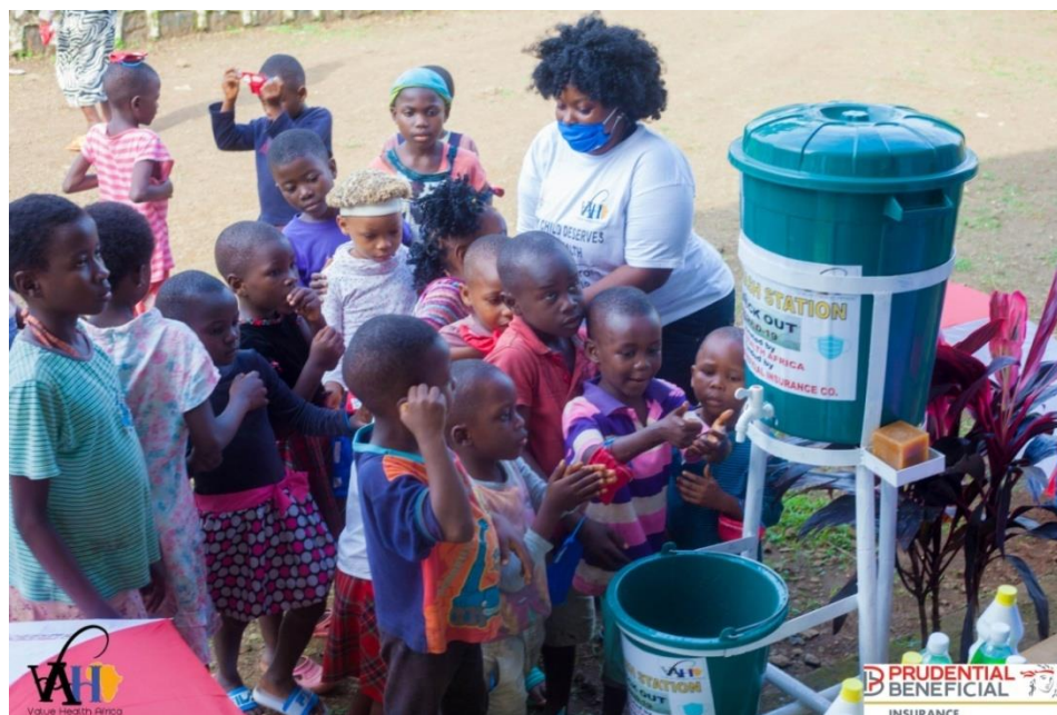
Figure 15: hand Wash education Sabibi Orphanage