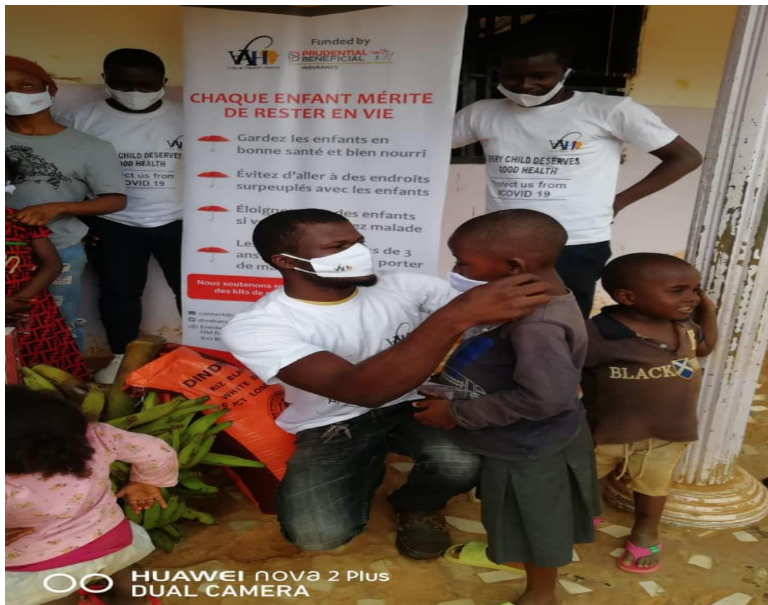
Figure 19: Sharing masks to Orphans of Le bon Berger