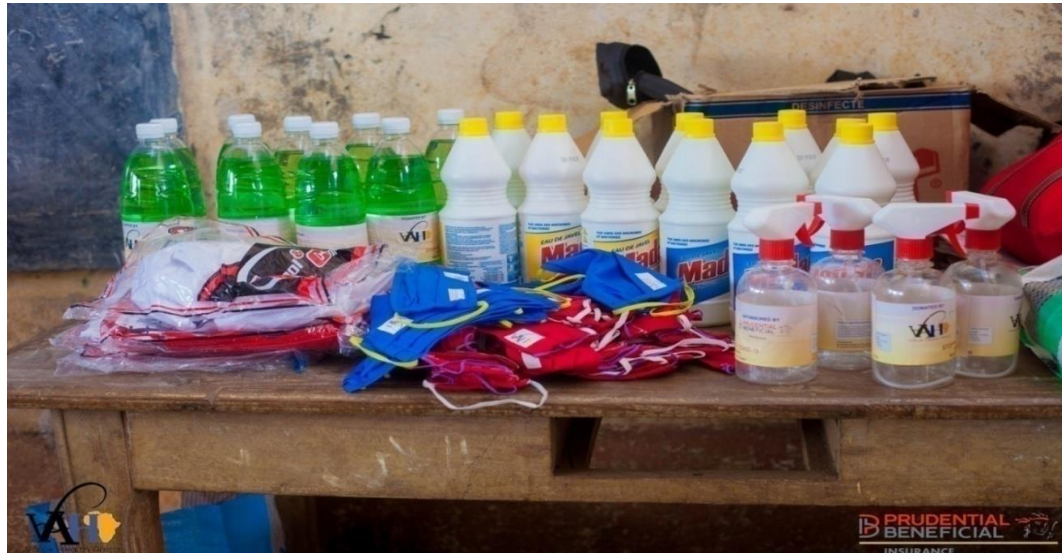
Figure 5: Donations to Bilingual Grammar School Molyko