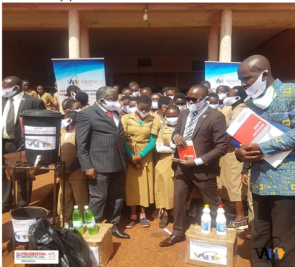
Figure 4: Donation of hygiene kits to GBHS Mbouda